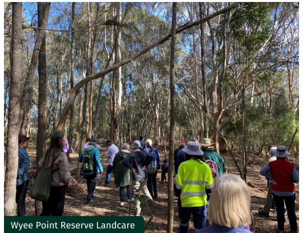
Wyee Point Reserve Landcare