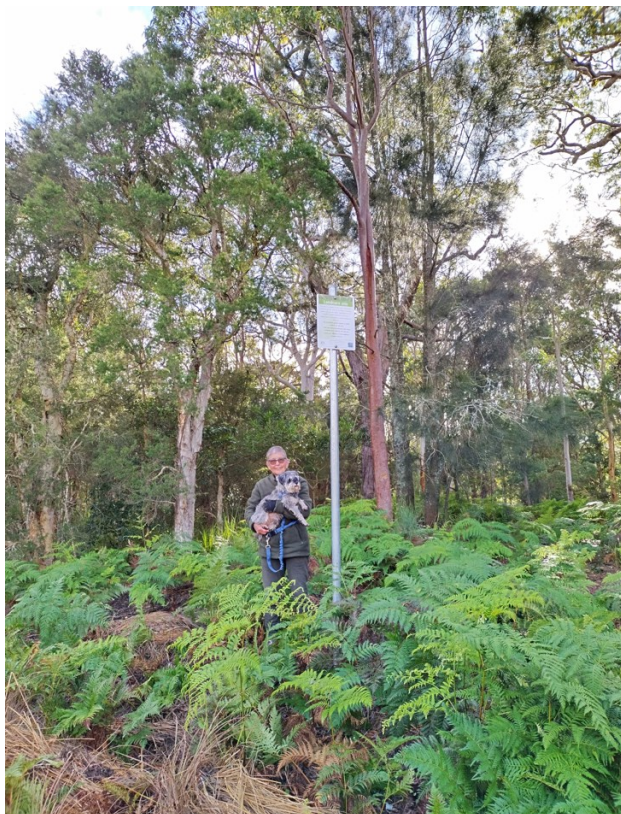
Above: Wendy and her dog 'Buddy' at Keith Barry Oval Landcare Site among dense bracken that has regrown following Paspalum removal

I am now starting on an extension to the Keith Barry Oval site and it is going to be a challenge. The extension is on the western side, over a hectare of bushland. The area nearest the lookout road has Lantana, Privet, and Paspalum quadrifarium aplenty. Unlike the rest of the site, the area close to the industrial area is covered with just about everything seen on other sites. The area is impenetrable. I plan to systematically weed sections as I have done in the main site, to eventually remove the target weeds. This area should also have good regeneration potential so it will be rewarding to see native plants come back and to support the important wildlife of the area (see my photo of a White-bellied Eagle nest on the Landcare sightings page).