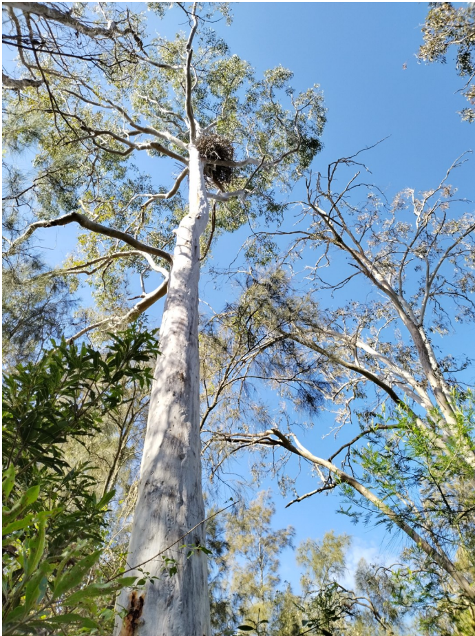
Above: The nest of White-bellied Sea Eagles, high above the bushland near Keith Barry Oval.

Check out these pictures contributed by Lake Macquarie Landcare volunteers and staff in recent months. Please keep sending in your photos and snippets for our newsletters, website and Facebook page.