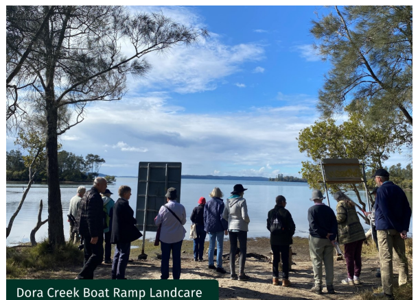
Dora Creek Boat Ramp Landcare

A huge thank you to the Landcare groups involved in this year's bus tour, and to the participants who joined in the day with sharing knowledge and admiring the important work being done.