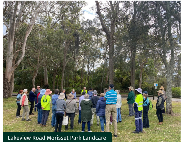
Lakeview Road Morisset Park Landcare