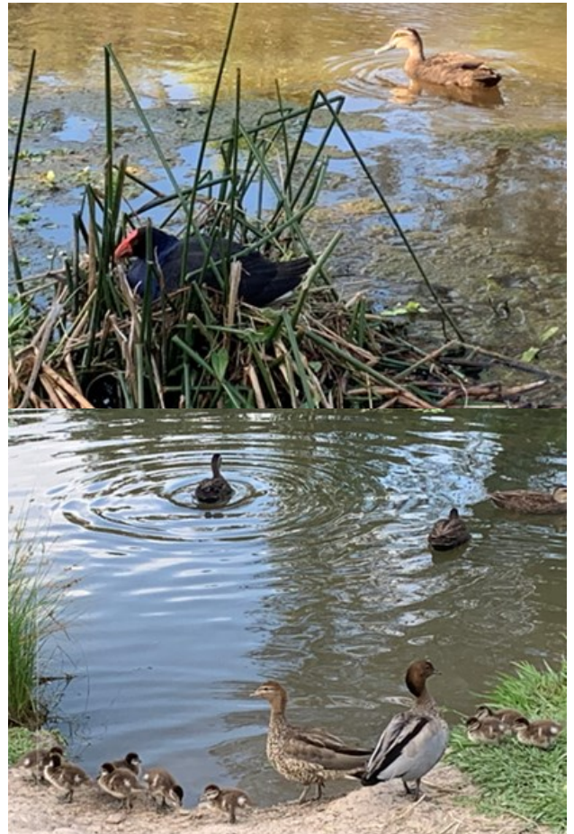
Above: A nesting Purple Swamphen and ducks with ducklings at Biddabah Creek Landcare