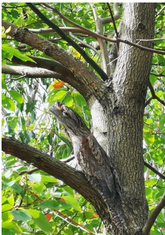
Tawny Frogmouth (left) and Dipodium variegatum Slender Hyacinth Orchid (right).

Check out these pictures contributed by Lake Macquarie Landcare volunteers and staff in recent months. Please keep sending in your photos and snippets for our newsletters, website and Facebook page.