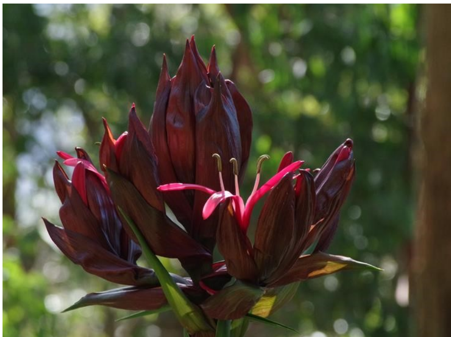
Above: Doryanthes excelsa, Gynea Lily at Mount Sugarloaf