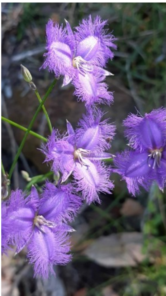
Left: Fringed Lilies at Dandaraga Road Fishing Point Landcare site.