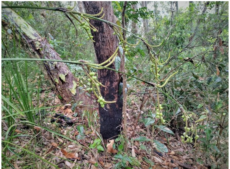
Settler's Twine at Stansfield Close Landcare Site.

This year Lismore's Rainforest Botanic Gardens, as part of their expo Celebrating the Power of Plants, highlighted this plant. They tested the 1870's claim. They took a leaf of the long-leaved clumping grass-type plant, held it up, and "kept adding weight until it broke at 56 kg - just one metre long and one-centimetre wide green leaf". That is one strong leaf.