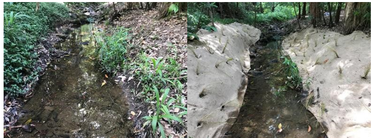
Before shot of the Blue Wren Creek bank.