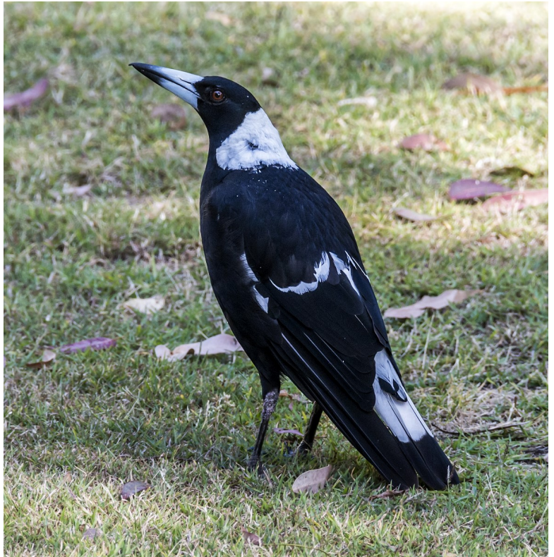
Above: Australian Magpie

But not one man that I have heard throws back his head in such a song of grace and praise – no man nor bird. Their greed is brief; their joy is long. For each is born with such a throat as thanks his God with every note.