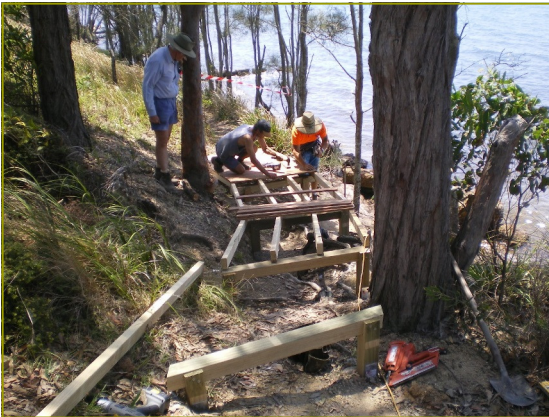
January 2010: The walkway had to be built around the existing trees and incorporate steps to climb up the hilly steep slopes.

The Coastcare grant also provided funds for bush regeneration works including weed removal and the planting of 2000 locally