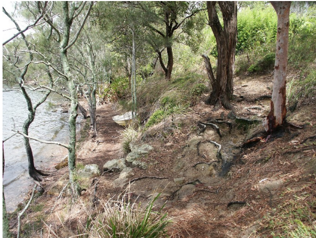
April 2007: Erosion on the foreshore of Lake Macquarie at Silverwater.

the beauty of the Morisset area. The group aims to ensure habitat for native animals through maintaining and restoring the natural bush areas, while providing a pleasant area for walks, picnics and barbeques.