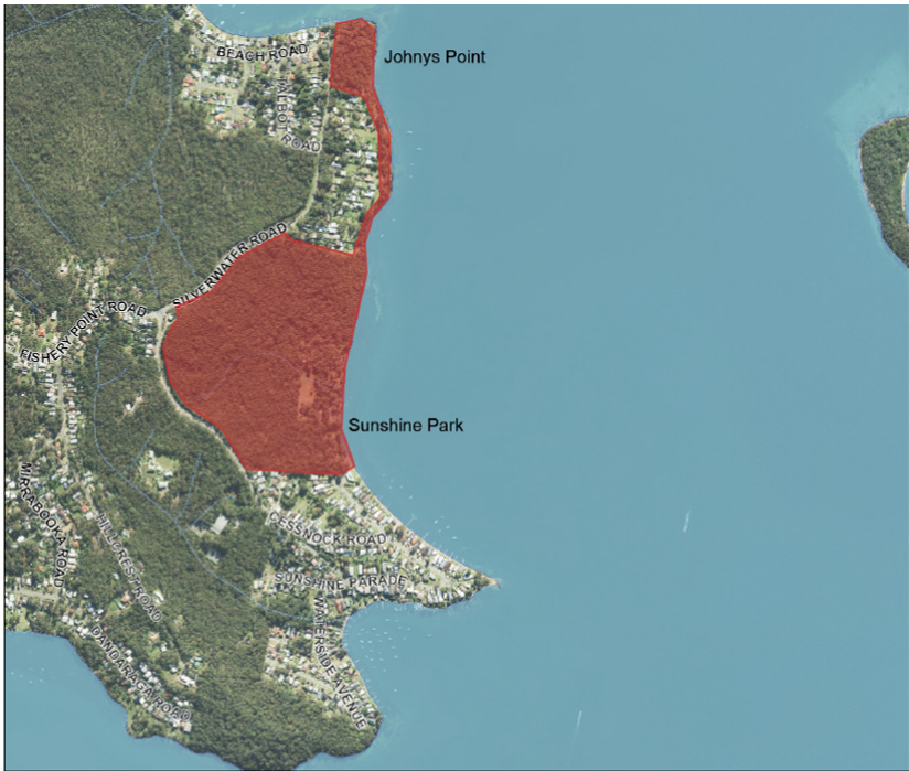
Sunshine Silverwater Landcare Site