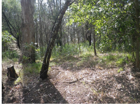
Before (left) and after (right) shows the removal of Asparagus Fern through the Crown Lands project

Ochna and Thunbergia alata (Black-eyed Susan) were also removed. The professional crew extended the weeding into areas too densely weed-infested or too close to cliff edges for the Sunshine Silverwater Landcare group to work.