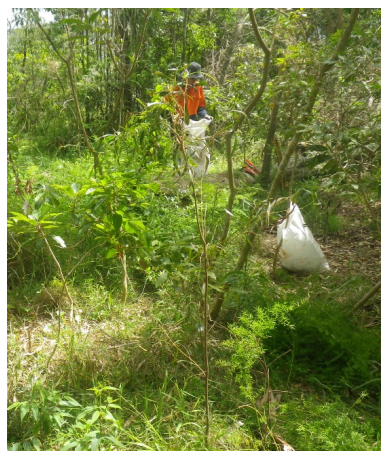
Above: Bush regenerator hand-removing Asparagus in a dense infestation

Primary weeding by a professional bush regeneration team, to assist the work of the Landcare group, removed Asparagus Fern, Lantana, Bitou and Climbing Asparagus in an area of 2ha at Johnys Point. Garden escapes like