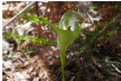
Sun Orchid (left) and Greenhood Orchid (right).