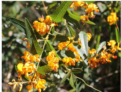
Native Holly Podolobium ilicifolium