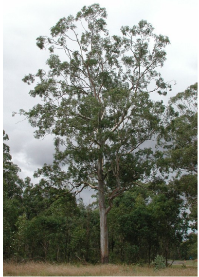
Eucalyptus tereticornis - Forest Red Gum

During spring, many wildflowers can be seen flowering, including Native Holly and other pea flowers, Lady Finger Orchids, Wattles, Pomaderris, Travellers Joy and also the vulnerable Tetradthea juncea