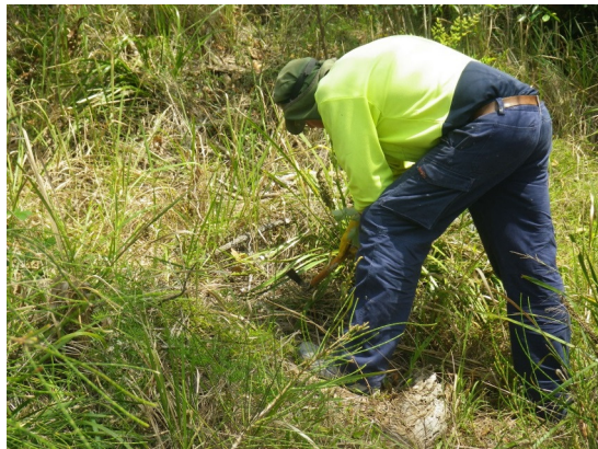
Above: Landcare volunteer chipping out the crown of an Asparagus Fern at Sunshine Reserve

Following the major storm in April 2015, a Green Army team was allocated to the region to assist storm-damaged areas with clean up and bush regeneration. The Landcare group had worked on clearing that up over several work sessions at the expense of regular weeding in the bush. The Green Army assisted the group in the control of Asparagus Ferns and Morning Glory at Johnys Point. They have also tackled some Blackberry, Fishbone Fern and Thunbergia (Black-eyed Susan).