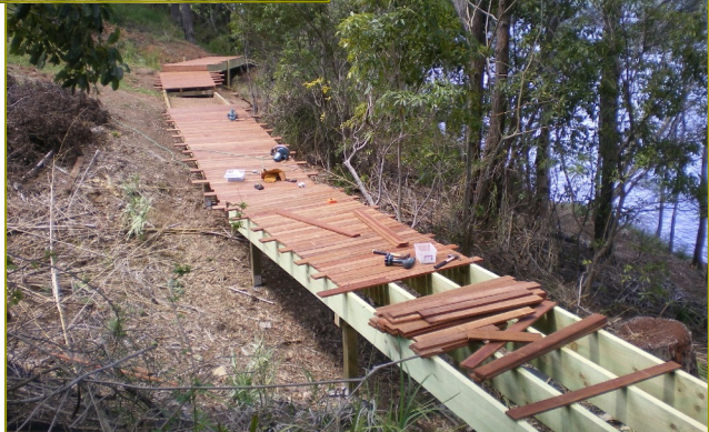
January 2010: Parts of the track have to cross deep gullies, that were revealed when the site was cleared of weed species. Larger beams had to be used to support the walkway.