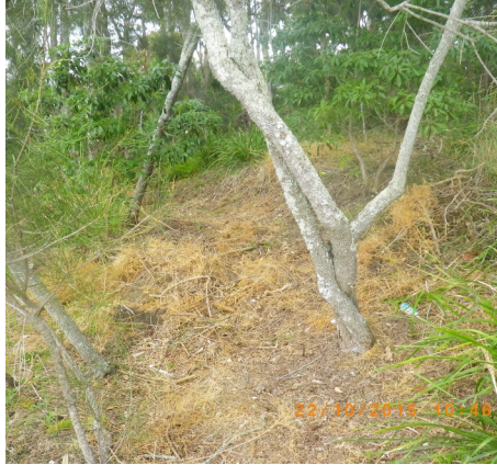
Above: Before (left) and after (right) weed control works during the Delta project