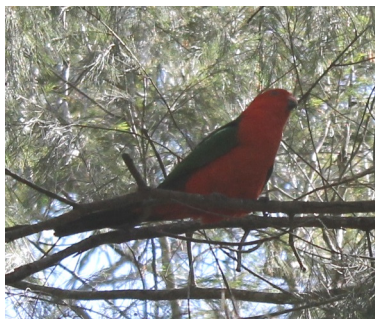
King Parrot at Johnys Point

The Sunshine Silverwater Landcare site is home to a variety of native fauna species. Bird species that have been sighted include Eastern Rosella, Rainbow Lorikeet, King Parrot, Superb Fairy Wren, Eastern Whipbird, Azure Kingfisher, Tawny Frogmouth, Satin Bowerbird, Australian Wood Duck and many more. Recently sighted was a small Lace Monitor.