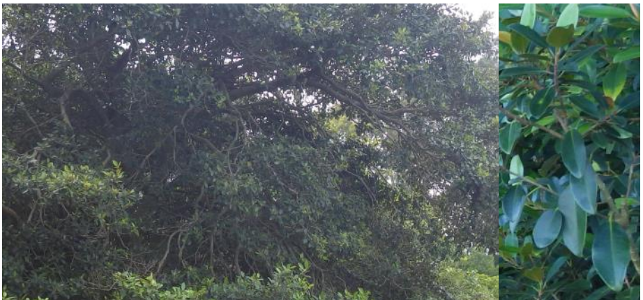
Port Jackson Fig