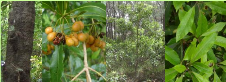
Pittosporum undulatum – Sweet Pittosporum