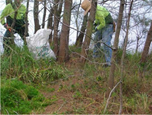
Lake Macquarie Landcare Green Team removing Asparagus Weed