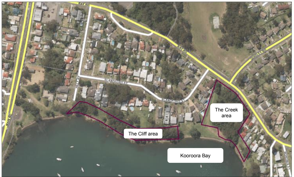
Above: Site locality (Kooroora Bay Landcare shown in maroon)

due to view corridors being created. The plant understorey varies from almost complete in some places (still with weeds), to non-existent in other places that are mown non-native grass areas. Over most of the area, garden plantings or garden escapees exist, in some cases keeping out the original vegetation.