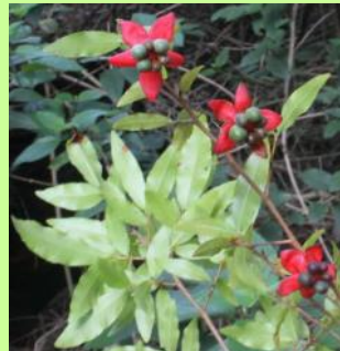
Mickey Mouse Plant