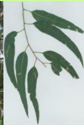
Eucalyptus tereticornis – Forest Red Gum