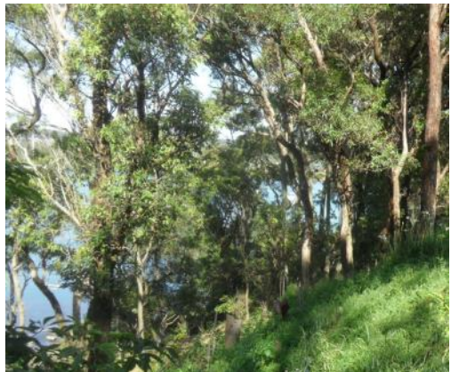
Kooroora Bay Landcare Cliff Site

due to view corridors being created. The plant understorey varies from almost complete in some places (still with weeds), to non-existent in other places that are mown non-native grass areas. Over most of the area, garden plantings or garden escapees exist, in some cases keeping out the original vegetation.