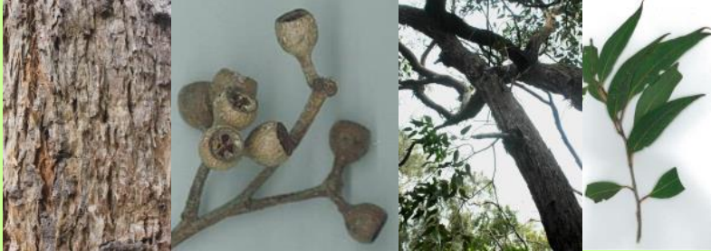
Eucalyptus umbra – Broad-leaved White Mahogany