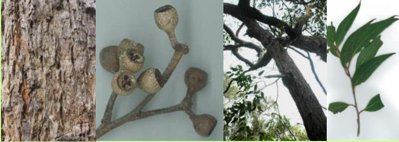
Eucalyptus umbra – Broad-leaved White Mahogany