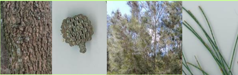
Casuarina glauca - Swamp Oak