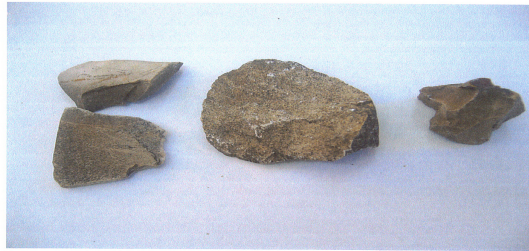
Above: Cutting tools and flakes found in the Lake Macquarie area